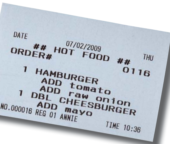
Kitchen requisition printed by the SPS-530 80mm receipt printer shown 75% actual size.