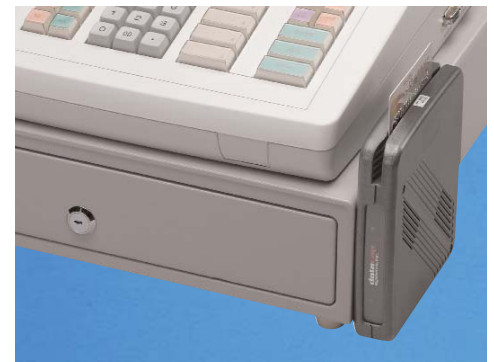
DataTran™ Integrated Credit Option