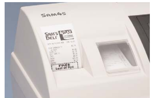
Quick and Easy Drop and Print Paper Loading