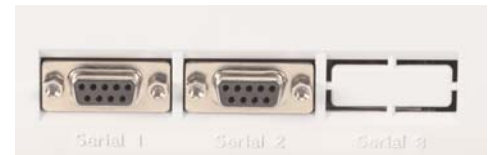
Two Standard RS-232C Ports