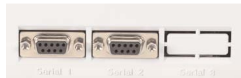
Two Standard RS-232C Ports