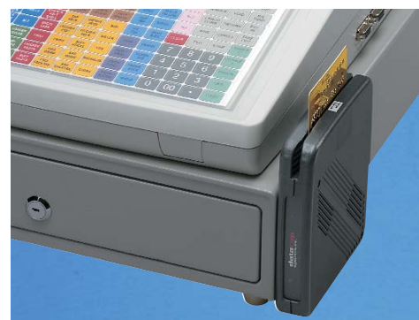
DataTran™ Integrated Credit Option