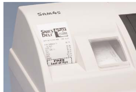
Quick and Easy Drop and Print Paper Loading